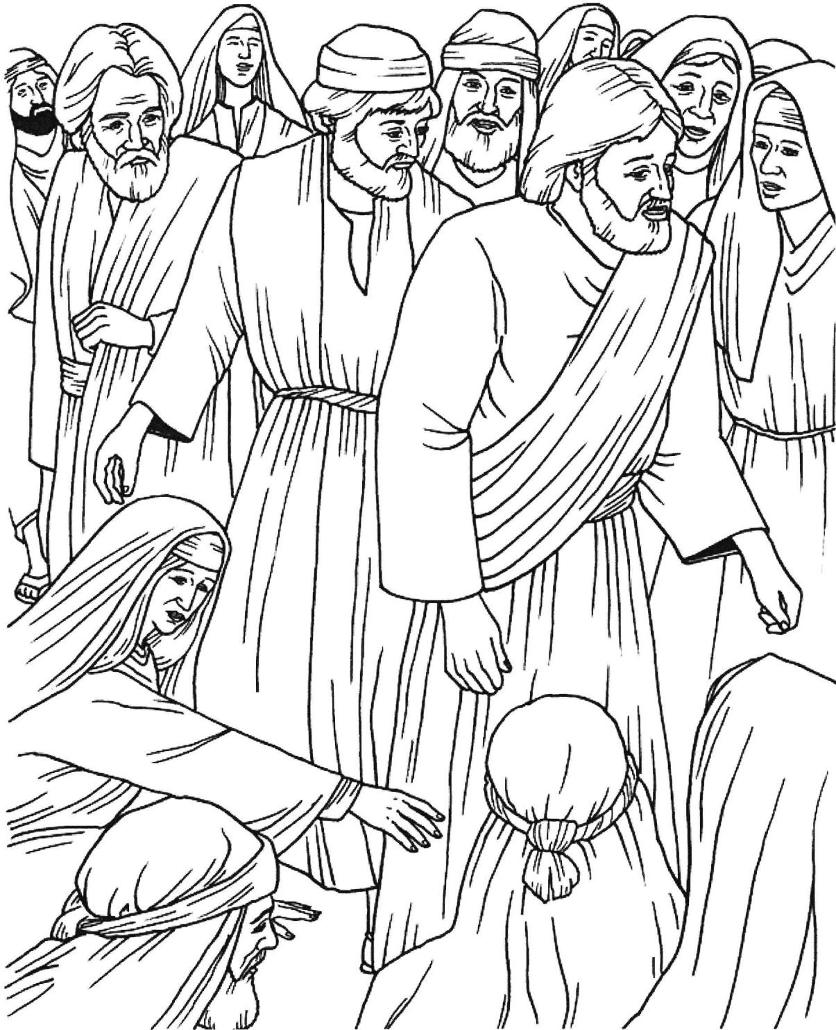
Touching the Garment Mark 5:24-34

From BibleStoryCard Learning System(tm) Coloring Book © 1996 Wesleyan Publishing House Used by permission. Additional BibleStoryCard resources available by calling 1-800-493-7539 or visiting online